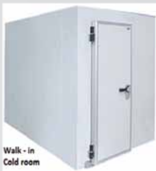
Walk - in Cold room