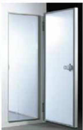
COLD ROOM HINGED DOORS