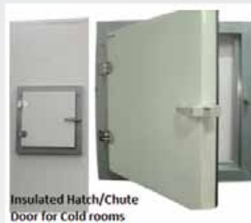
Insulated Hatch/Chute Door for Cold rooms