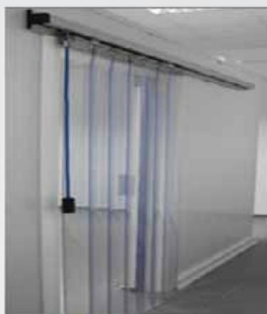
PVC Strip Curtain