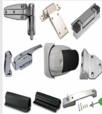
Cold Room door Hinges, Handles, Locks, Rubber Gaskets