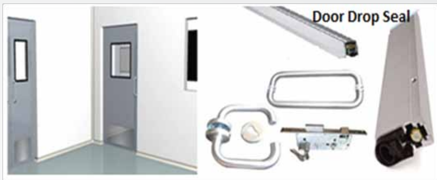
Door Drop Seal