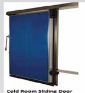
Cold Room Sliding Door